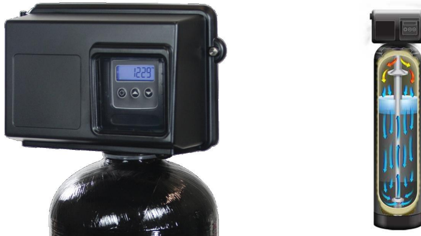
Fig 1 - AIO 2510 SXT Control Valve, Front View

A daily backwash will remove accumulated iron and replenish the filter media bed. The regeneration process also adds a fresh air pocket to the system.