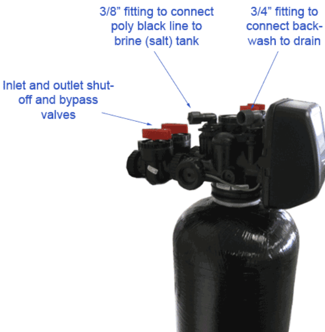
Fig 2 Clack WS1 Softener Control