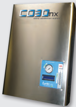
CD30nx Ozone Generator