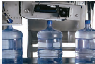
BOTTLED WATER FILL LINES