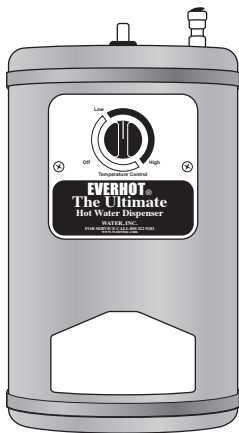
Stainless Steel Shell

Maximum Dimensions: Width: 7" Height: 13" Depth: 9"