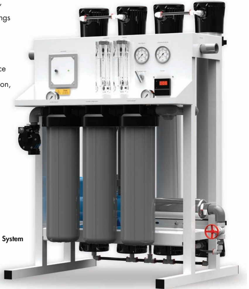
CT-7000 Reverse Osmosis System Front

CT-Series Reverse Osmosis Systems have been engineered for capacities ranging from 4000 – 7000 gallons per day.