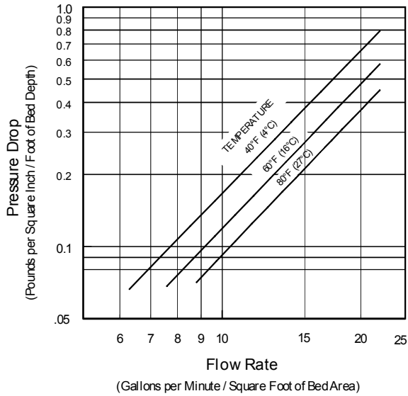
Service Flow Pressure Drop