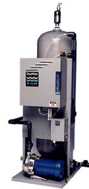
Ozone skids are pre-piped and pre-wired.