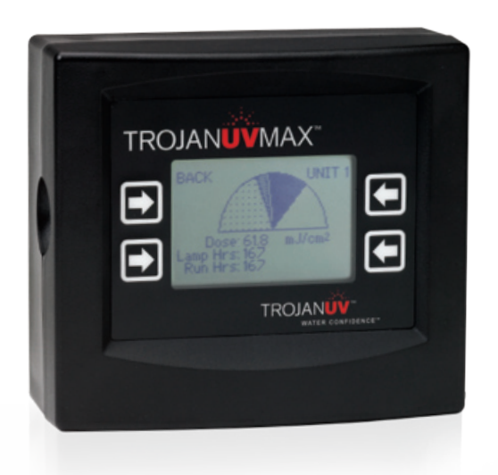
The optional COMMcenter displays dose in real-time and can monitor up to 9 UV systems - that's up to 270gpm!