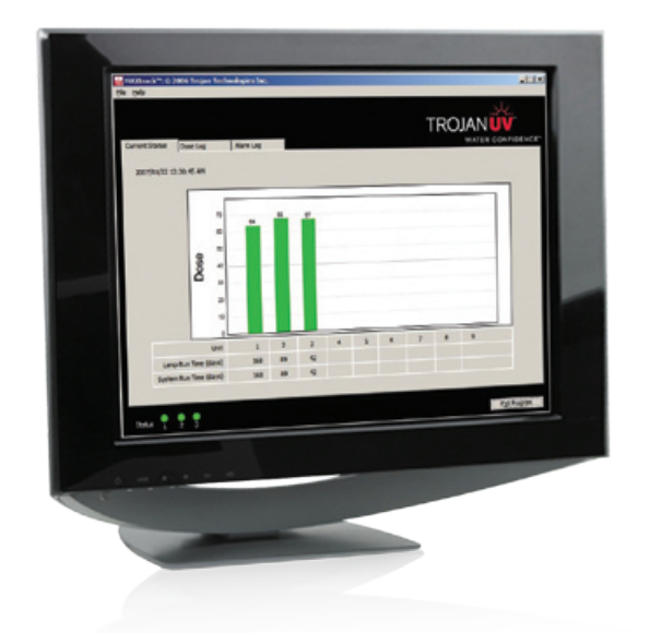
MAXtrack software gives you the ultimate in real-time monitoring and data logging.

What's more, you can have that information presented to you wherever you need it. The COMMcenter can be installed at any distance from the UV system using standard computer cable. Or go wireless with an optional FCC compliant wireless transmitter.