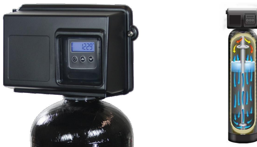
Fig 1 - AIO 2510 SXT Control Valve, Front View

A daily backwash will remove accumulated iron and replenish the filter media bed. The regeneration process also adds a fresh air pocket to the system.