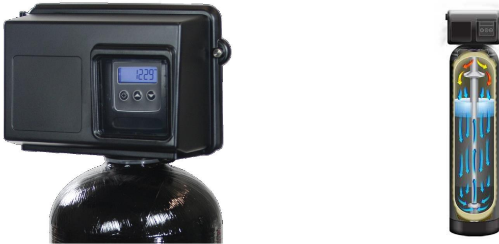
Fig 1 - AIO 2510 SXT Control Valve, Front View

A daily backwash will remove accumulated iron and replenish the filter media bed. The regeneration process also adds a fresh air pocket to the system.