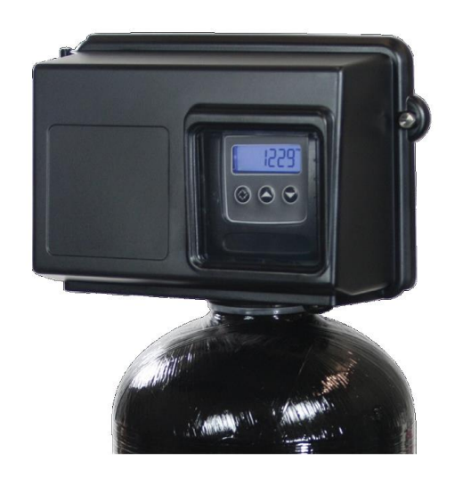
Fig 1 - AIO 2510 SXT Control Valve, Front View

The Air Charger AIO Filter, when properly applied, is an efficient and cost effective system for the removal of iron and sulfur. The AIO control valve maintains a compressed "air pocket" in the top of the tank while the system is in service. As the water passes thru the air pocket, iron and sulfur are oxidized. Additionally, dissolved oxygen is added to the water. The Air Charger AIO filter media bed then removes the iron and sulfur from the water.